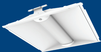
BLTR Relight Series